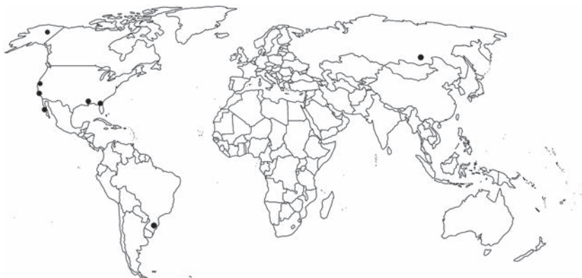
Fig. The known world distribution of Bacidia reagens .

al. , 2004). The species was later found on a Picea branch in Fairbanks-North Star Borough in Alaska along Chena River (Dillman et al. , 2012). In Transbaikal Territory B. reagens was also found in humid localities on the bark of Sorbus sp., at altitudes of 755 and 816 m a. s. l. in the Kodar Ridge.