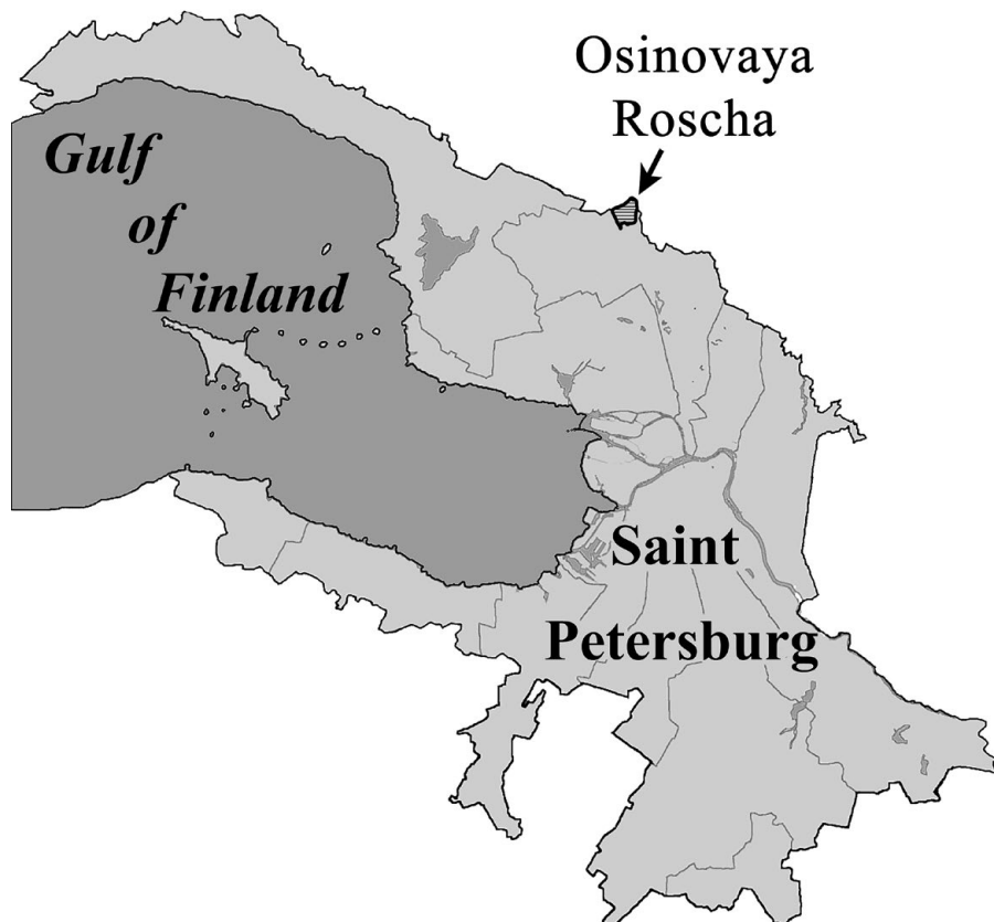
Fig. 1. The location of the study area in the limits of St. Petersburg.

is partly occupied by horse riding club, former military buildings, and private gardens. The proposed protected territory Osinovaya Roscha is restricted by Vyborgskoe and Priozerskoe highways and the border of the Leningrad Region and has a total area of 1.9 km 2 (Fig. 2).